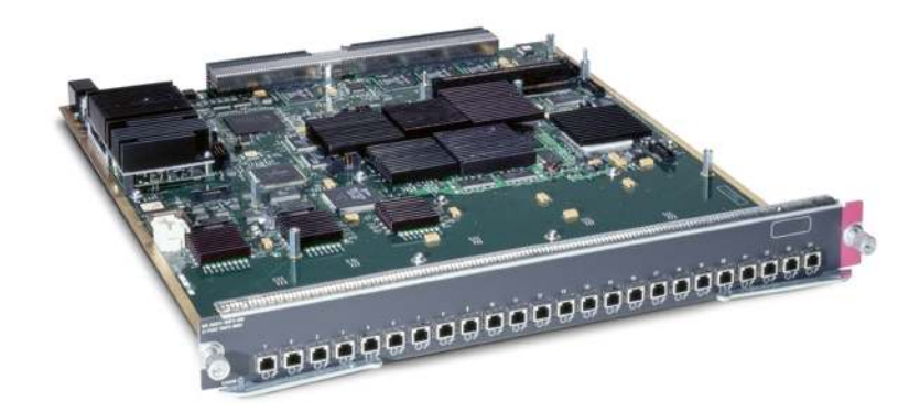
Figure 3. CEF256-Based 100BASE-FX Fiber Interface Module (part number WS-X6524-100FX-MM)